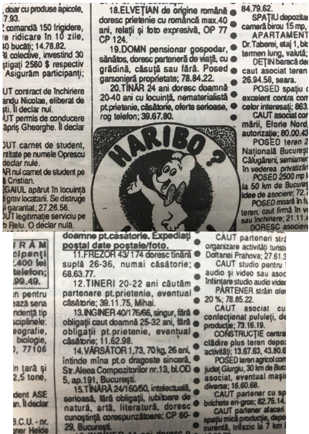
Picture 2. Post Communist Personal Ads.

A courteous, somewhat more restrained PA such as: “EU, 40/178, atractiv, charmant, curajos, cu mult succes în meseria mea de inginer și iubitor de muzică, pictură, sport, te caută pe tine, simpatică, frumoasă și înțelegătoare de franceză și engleză”. [I am, 40/178, attractive, charming, brave and successful engineer, a lover of painting, music and sports and look for you, a nice, good-looking girl, knowledgeable of French and English] differs in style and register from “Manager bancar, 33/160/55, doresc economiștă (studentă) inteligentă, fascinantă, realistă, uluitoare, weekend munte” [Managing banker, 33/160/55,