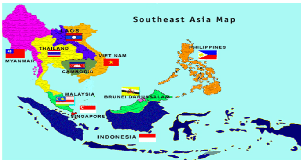
Figure 1. The Countries of ASEAN

The history, unique and interesting to each country, has changed somewhat over time with geopolitical and sociocultural conditions and analytical trends, according to Kondratas et al. (2015, 9), and cannot be distinguished from the present, basing upon a deeper understanding of the past, according to Houben (2014, 28). Taken various modalities, according to Kelertas (2006, 28-29), colonial domination depicts different-important facts of colonial empires, needs, strategies, trajectories of expansion or contraction, and levels of territorial penetration, control and exploration. Said (1993) notably argues some areas—the Middle East and China—were not colonized, but were more affected by “colonialism” than many countries that were. Some countries—Ghana, Nigeria or Senegal—were relatively swift and generally peaceful, but others—Algeria, Kenya, Mozambique or Vietnam—were protracted, vicious, and bloody (Kelertas 2006, 28-29). Houben (2014, 29) identifies Southeastern Asia as the area between India and China ( Figure 1 ), as a military strategic concept during the Second World War for almost seventy years, and as an endeavor of the studies research and a successor to the European tradition of studying their own-colonies, in the era of the Cold War from the 1950s.