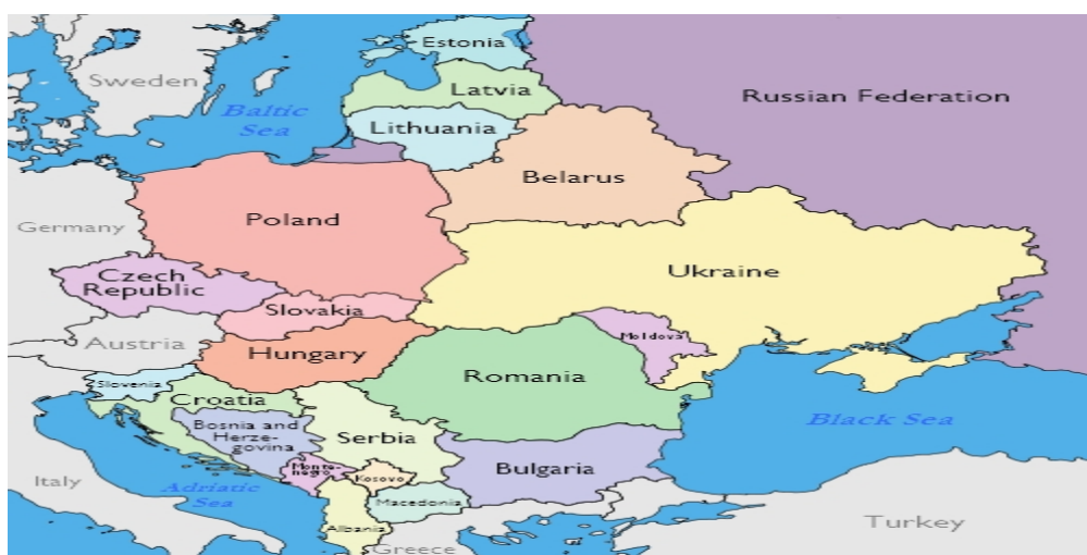
Figure 2. The countries of Central Eastern Europe

scholars recognize that Soviet Russia or the USSR is not construed as an empire, but only “Soviet imperialism”, except the US during the Cold War, as Andreescu (2011, 58) in Are We All Post-colonialists Now? writes “Postcolonial Studies scholars have traditionally paid little attention to Soviet Russia and its Central and Eastern European satellites.” In the 20 th century Russia acknowledges only old “capitalist” empires—England, Germany, Spain, France, Holland, and Portugal—as colonizers, without looking at itself as a colonial empire, according to Kelertas (2006, 1).