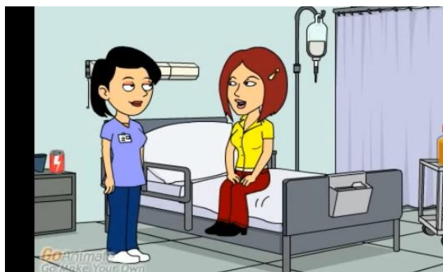
Fig. 7 GoAnimate video

A complex movie maker version including voice interaction but also more difficult to realize professional animated videos is Goanimate (Fig. 7) – a video creation platform, which offers a 14 day trial period. The characters' replies can be read by a synthesized voice or recorded through microphone. Sound effects, music, props, entrances, exits, and downloads are available.