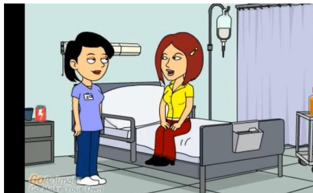
Fig. 7 GoAnimate video

A complex movie maker version including voice interaction but also more difficult to realize professional animated videos is Goanimate (Fig. 7) – a video creation platform, which offers a 14 day trial period. The characters' replies can be read by a synthesized voice or recorded through microphone. Sound effects, music, props, entrances, exits, and downloads are available.