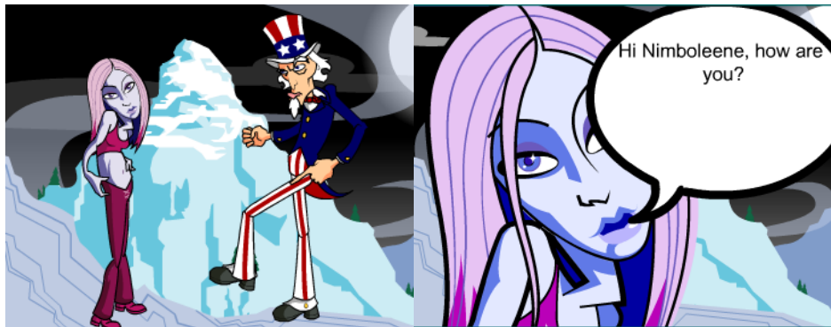
Fig. 6 Dvolver movie maker

features such as his/her traits and likes and background details, which are helpful, especially for beginner students. Each character's lines are typed within a limit of 100 text characters per character's line. The drawback of this tool is the background music which starts playing if the movie is embedded in a site or wiki. Dvolver movie maker is suited for grammar or vocabulary assessment in the more cognitive rather than the creative/affective stage of ESP learning, with lower level students for whom creation of several exchanges can be a challenge.