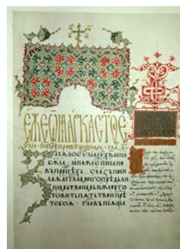
Fig. 1b) The first page of Mark's Gospel, fol. 90 r