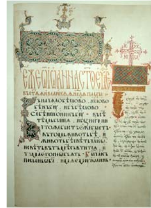
Fig. 1d) The first page of