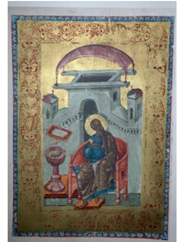
Fig. 2d) St. Evangelist John, fol. 235 v