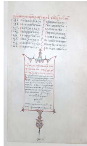
Fig. 3) Page with secondary ornamentation and initials Fig. 4) The last page of the manuscript with the colophon