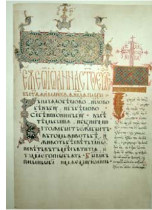
Fig. 1d) The first page of