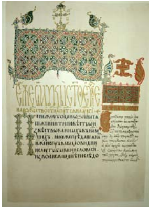
Fig. 1c) The first page of St Luke's Gospel, fol. 145 r John's Gospel, fol. 236 r