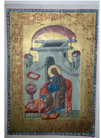
Fig. 2d) St. Evangelist John, fol. 235 v