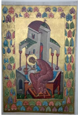
Fig. 2c) St. Evangelist Luke, fol. 144 v