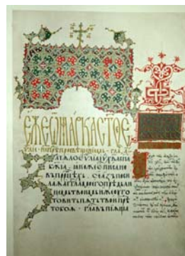
Fig. 1b) The first page of Mark's Gospel, fol. 90 r