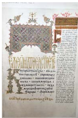
Fig. 1a) The first page of St Matthew's Gospel, fol. 7 r Gospel, fol. 90 r

As mentioned above, Ion Bianu reproduces ten images from the manuscript, and describes them accurately saying that “on four folios there are reproductions of the opening pages of the four Gospels, each of them with two headings in colour, one for the Slav text, which is the main one, and another one, smaller, for the Greek text [Fig. 1. a, b, c, d]. On other four folios the faces of the Evangelists are reproduced [Fig. 2. a, b, c, d]. A folio has secondary ornamentation and initials on it [Fig. 3], and the final folio has the epilogue of the text containing valuable data regarding its origins [Fig. 4]. Of a special importance are the portraits of the Evangelists, both for the variegated and rich borders and for the architectural motifs [which surround them], but especially for the manner in which the artist treats the figures of the writers” 1 .