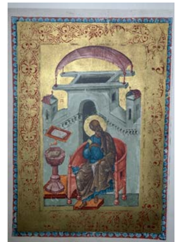
Fig. 2d) St. Evangelist John, fol. 235 v