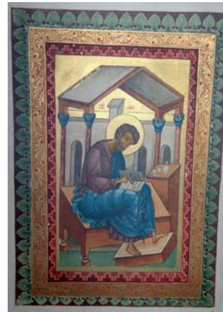
Fig. 2b) St. Evangelist Mark, fol. 89 v