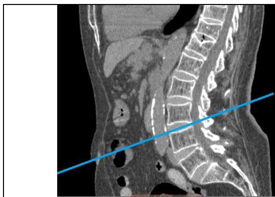
Figure 1. Sagittal Multiplanar reconstruction. With blue- the oblique plan used for Multiplanar reconstruction. On the sagittal incidence are visualized, among others, the heart, aorta and SMA, liver, pancreas, lower thoracic, lumbar and superior sacral vertebral bodies and abdominal fat.

Multiplanar reconstructions were obtained using the default kernel- B31 Medium Smooth with an oblique section between the anterior-superior aspect of the L4 vertebrae and the umbilicus. Due to various sections being described in literature we considered as optimal the section parallel to the one used by clinicians in measuring the abdominal circumference.