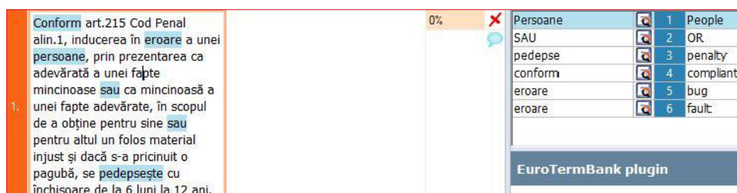
Figure 1. No hits for închisoare without a TB

We have created a term base in .xlsx format, including all the translations of închisoare (prison) found in the dictionaries (see Appendix). The list contains thirteen possible translations in alphabetical order: city jail , confinement , county jail , detention , gaol , imprisonment , jug , limbo , penitentiary , penitentiary , prison and quod . Then we created a project in memoQ , and a sentence from the Romanian Penal Code was inserted containing the term închisoare . Figure 1 shows that there were no translations found for the term (last column) using the activated machine translation tools (seven MT tools were activated, including Google Translate ):