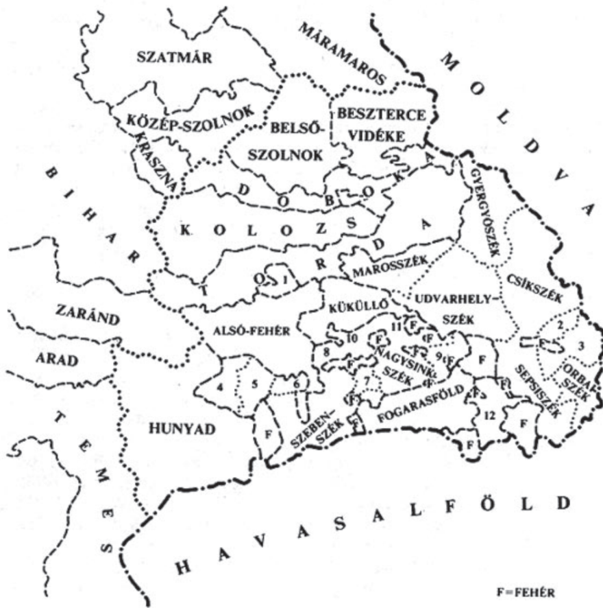
Map: the geographical distribution of the language data of the Historical Dictionary of the Hungarian Language in Transylvania

stem words and words with derivational suffixes, but also those with inflectional suffixes (e.g.: -ba , -be , -ban , -ben , -int , -képpen , -kor , -lag , -leg , -lan , -len , -szor , -szer , -ször ). So, for instance, if we only take into consideration the lexical family of the word ‘ akadály ’, then there are the following entry words in the first volume of the dictionary: akadálykodik , akadályos , akadályoskodás , akadályoskodhatik , akadályoskodik , akadályoz , akadályozhat , akadályoztat , akadályoztatás , akadályoztathat , akadályoztatik , akadályoztató , akadályoztattatik .