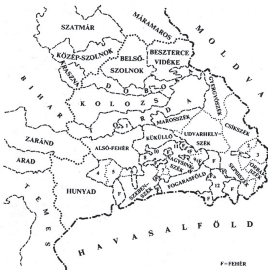
Map: the geographical distribution of the language data of the Historical Dictionary of the Hungarian Language in Transylvania

stem words and words with derivational suffixes, but also those with inflectional suffixes (e.g.: -ba, -be, -ban, -ben, -int, -képpen, -kor, -lag, -leg, -lan, -len, -szor, -szer, -ször). So, for instance, if we only take into consideration the lexical family of the word 'akadály', then there are the following entry words in the first volume of the dictionary: akadályodik, akadályos, akadályoskodás, akadályoskodhatik, akadályoskodik, akadályoz, akadályozhat, akadályoztat, akadályoztatás, akadályoztathat, akadályoztatik, akadályoztató, akadályoztattatik .