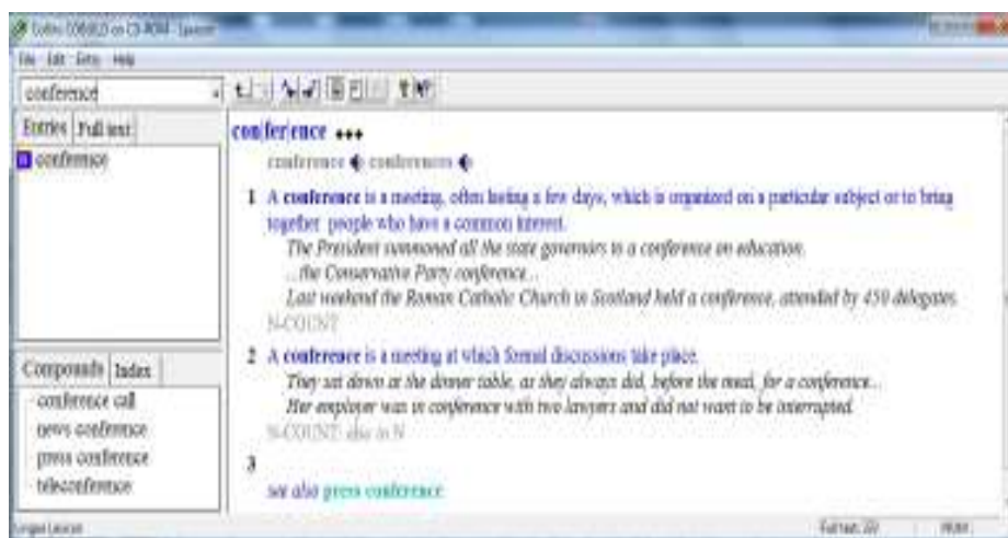
Figure 1: the English context for ‘conference’

It is obvious from the context in Example 3 above that a meeting of chiefs or leaders of Arab governments is intended, thus the latter rather than the former should be used. A cursory look at Figure 1 and Figure 2 below shows how ‘conference’ and ‘summit’ are used within English context through a number of authentic examples in italics.