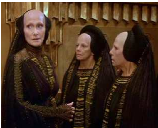
Alia Atreides The Bene Gesserit