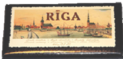
Picture No. 2. Chocolate Rīga is especially popular among tourists.

After 1990, in the years of independence, the usage of the name of the country in the names of commercial products and especially in the names of companies was restricted by instruction (Resolution No. 462, § 2.4 of the Council of Ministers of the Republic of Latvia, 04.11.1992) on purpose to protect oneself against belittling of the patriotic notion. Nevertheless there are such names in use – which are connected with luxury products, for instance: box of sweets Latvija , Rīga , chocolate Rīga , cheese Latvija , etc. (See Pictures No. 2, 3, 4.). One of the most favourite names in commercial products is Vecrīga ('Old Riga'): name of the cake Vecrīga , name of liqueur Vecrīga , etc. All these products are known with positive connotations. They are also meant to be enticing pieces of souvenirs.