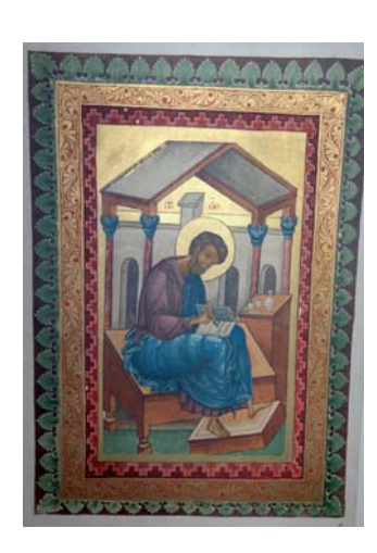
Fig. 2b) St. Evangelist Mark, fol. 89 v