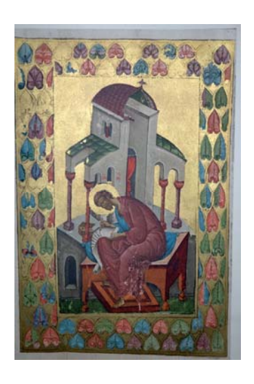
Fig. 2c) St. Evangelist Luke, fol. 144 v