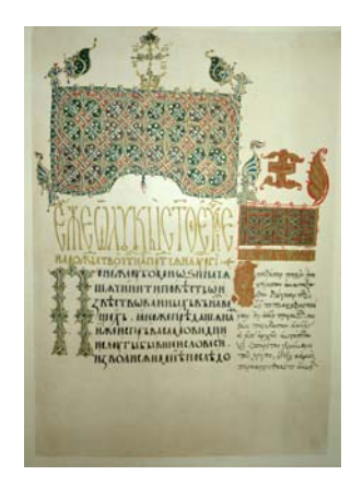
Fig. 1c) The first page of St Luke's Gospel, fol. 145 r John's Gospel, fol. 236 r