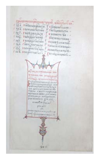
Fig. 3) Page with secondary ornamentation and initials Fig. 4) The last page of the manuscript with the colophon