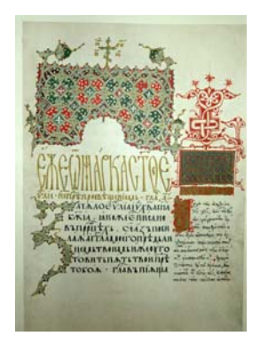
Fig. 1a) The first page of St Matthew's Gospel, fol. 7 r Gospel, fol. 90 r