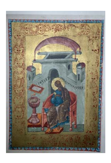
Fig. 2d) St. Evangelist John, fol. 235 v