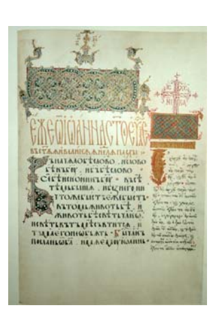
Fig. 1d) The first page of