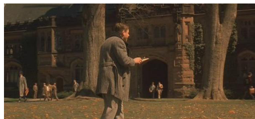
Fig. 2 Russell Crowe as John Forbes Nash, Jr. in A Beautiful Mind.

If the discursive psychology is applied to the conversational turns, the social action that John promotes is his intention to find an algorithm to define the pigeons’ movement; it is the world that Nash constructs for himself in order to find the original idea. His reply makes his colleagues label him as psycho ; the university courtyard where John analyses the pigeons represents the location where he develops his occupational identity. Figure 2 illustrates the movie picture including the setting representative for the above interaction and it also illustrates the public distance Nash exerts towards his colleagues that he treats as complete strangers.